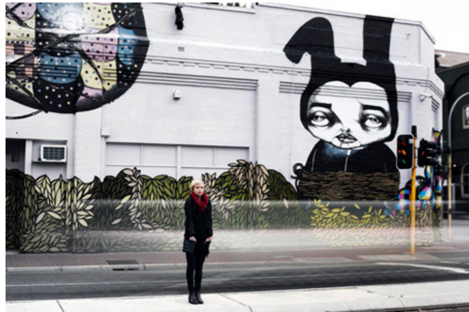
An image from the Artrage Mural, Northbridge.