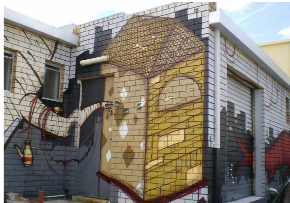
An example of a mural painted by one of the Last Chance Studio artists (Creepy.) Creepy is well known for using elements of buildings and characters in his designs.