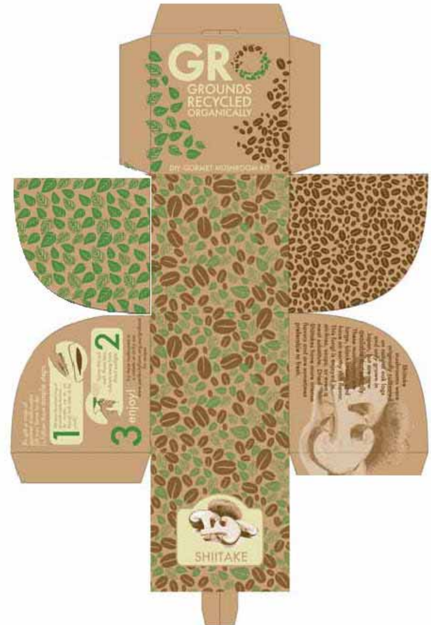
Fig 3. Colour template of box