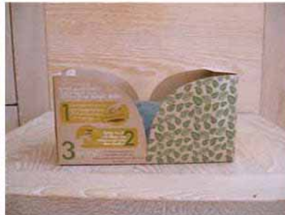
Fig 2. The box when open