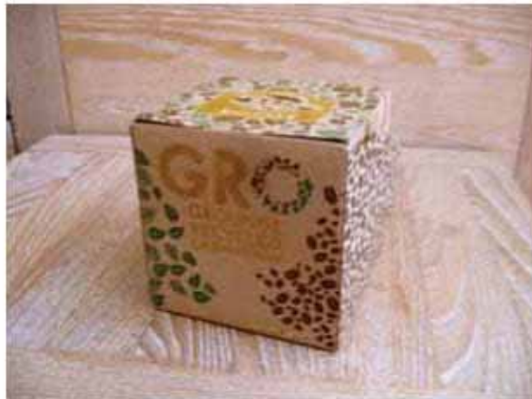
Fig 1. The box when closed

Retail box Large - 2.5 kg 15cm x 15cm x 15cm